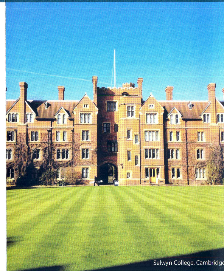
Selwyn College, Cambridge